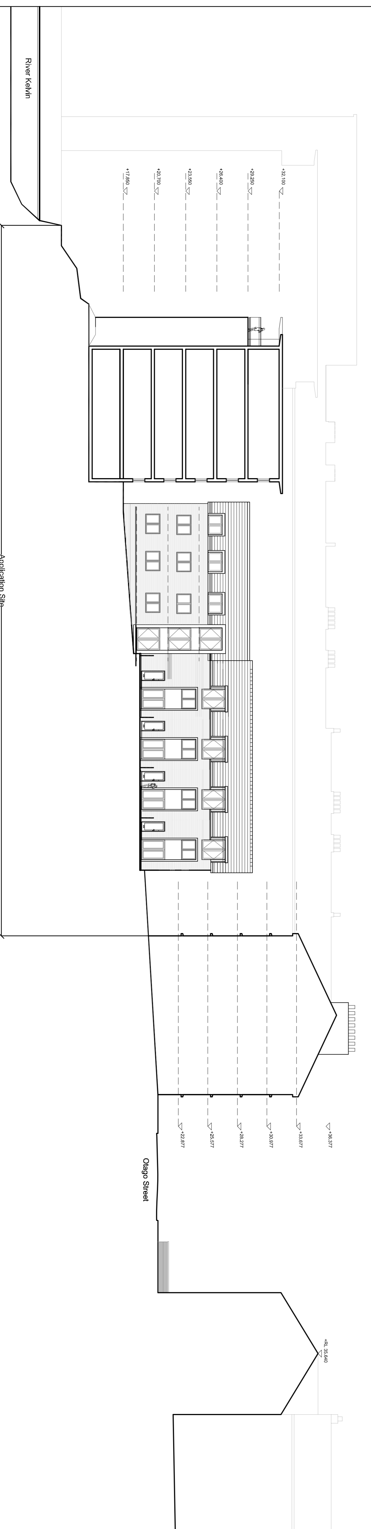
Proposed North Elevation to Block B